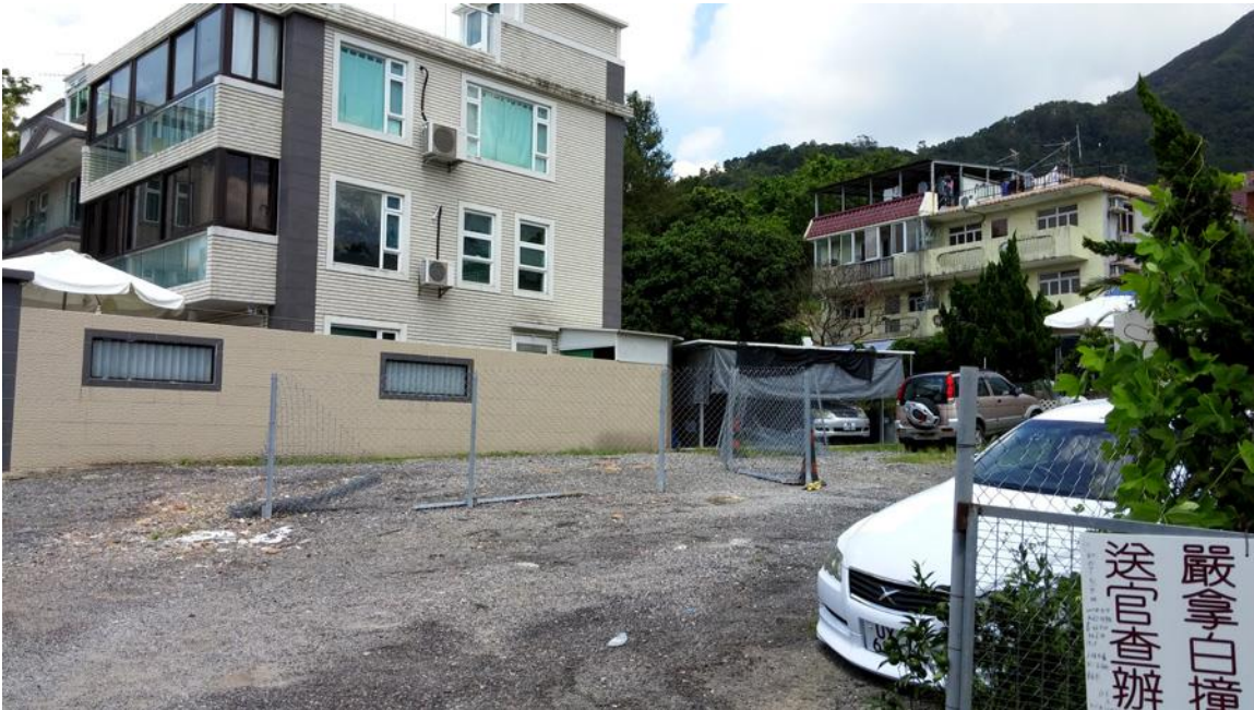
After image taken September 2017